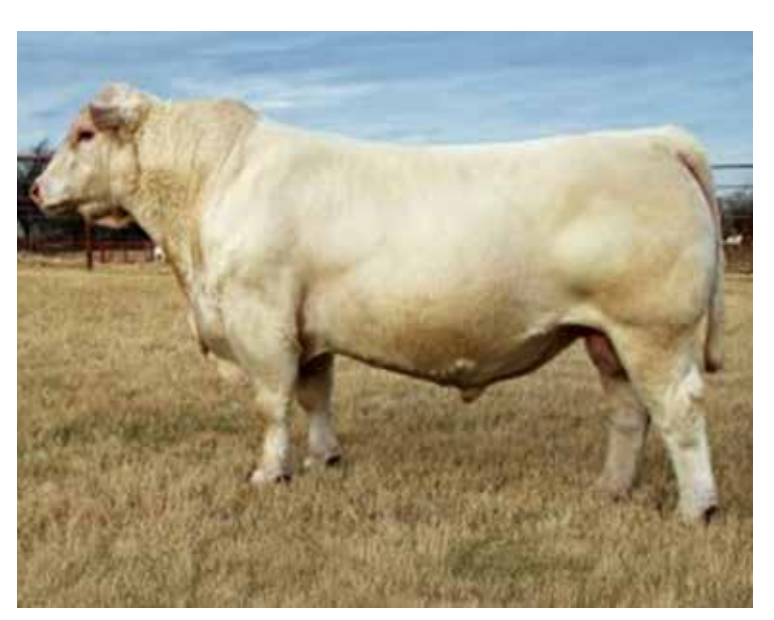
M6 SLAM DUNK 3115 P ET DAMSIRE OF LOT 7