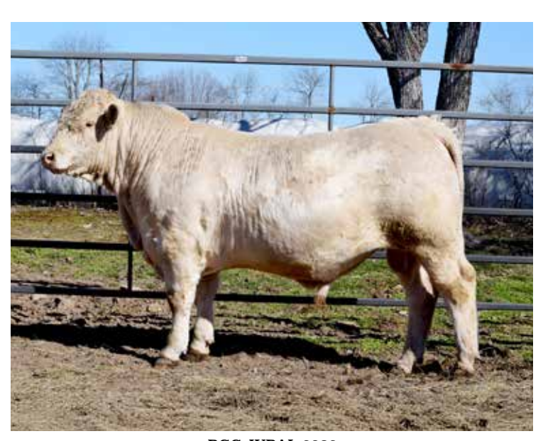
BGC JUBAL 2302 SELLS AS LOT 1

This legendary cow can have volumes written about her and her progenies. One of the alltime most influential cows in the Charolais breed. She was the first cow family listed in the M6 Dispersal sale. His footnote on the dispersal was "the Germaine Family is built to last". She topped the 2016 M6 sale with her daughter at $15,250.00. But her offspring like M6 Ms New Germaine 484 sold for $36,000, and her heifer calf for $$9,000.00. A full brother sold for $30,000. Another heifer, 579, $19,000, to just mention a few in the dispersal sale. The offspring of 1145 in the Dispersal sale totaled up $167,500.00. And since then, many more of her sons and daughters have topped sales or at the very top, including the 2023 Southern Connection, a bull sold for $7, 500.00, 2021 Appalachian, a son for $6300.00 to top the bull sale. In the 2022 Appalachian, a daughter, 585, produced the top seller, an open heifer at $5,000. This cow family is one of the most prolific in production and profit! A fantastic opportunity now with lots 1-8 of maternal sibs out of 1145 and different breed leading sires! What an unbelievable opportunity to invest in a well thought-out and proven program to lead your herd into the next phase of more profit and proven program!