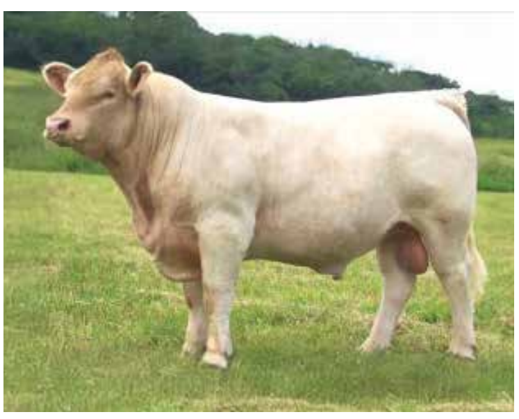
WIA MANTRACKER 150 PLD GREAT-GRANDSIRE OF LOT 20