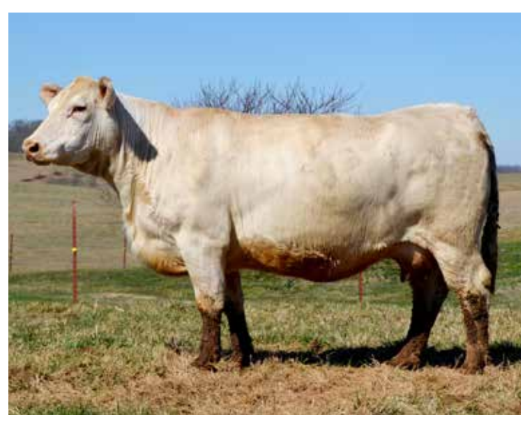
REAVES MS GERMAINE PATRIOT 815

PE to Reaves Mr Value Added 2255, EM977005. Maternal sib to Lot 23, out of the great donor 815, that sold in the 2023 sale to KK Charolais, IL. A daughter of 2066 by Tank is working in the Hoilman herd, TN. Great EPDs ranking in the top 10% WW, 15% YW, 10% Milk, 5% MTL, 10% CW, 5% REA, Marb, and TSI.