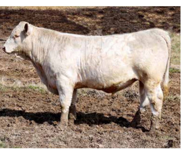
REAVES MR JOE VALUE 2422 SELLS AS LOT 10

Sells Fertility and Trich Tested. Selling Full Interest and Full Possession A maternal sib sells as Lot 33 sired by Hondo. The dam is a super addition to the Reaves ET program was a top selling cow in the Finks Sale at $30,000.00+. I hope you study this bull well, he shows tremendous future, with good extension, length, skeletal correctness, and with this pedigree you will develop some of the greatest females in the breed!