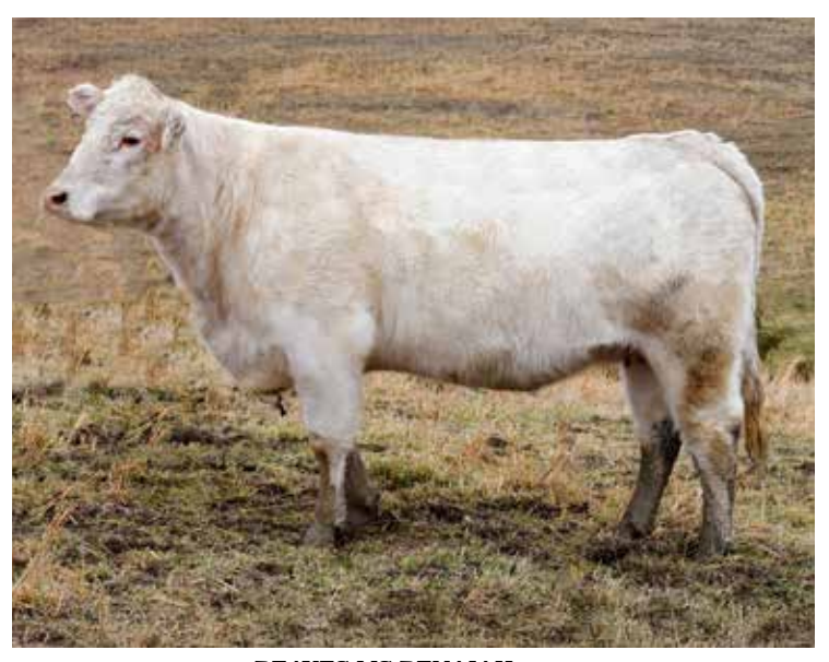
REAVES MS BENAIAH 2205 SELLS AS LOT 30