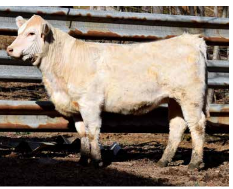
MILHORN'S BIG STANDARD 2304 SELLS AS LOT 17