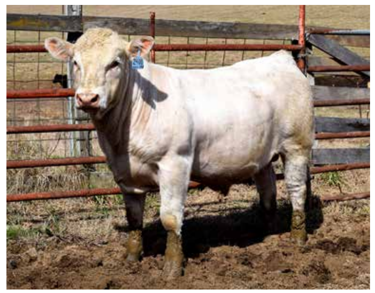
MILHORN'S SOUTHERN AFFINITY 00 SELLS AS LOT 5