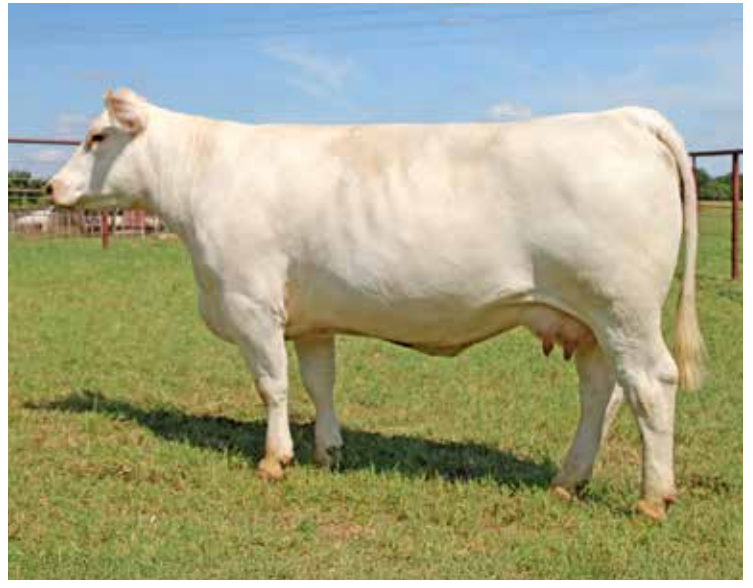
M6 MS NEW NANCY 277 P ET DAM OF LOT 37

Bred A-I on 10/16/24 to LT Blue Value 7903 ET, safe in calf. Cawley Cattle Co. GA., now owns WCR Gambler 1167 P., a DC/CRJ Tank E108 P son bred by Wienk Charolais. Her EPDs rank her in the top 4% Milk, 15% MTL, and 40% for TSI, at 271.69. The Blue Value calf will probably make this a free cow as it will return a great profit if sold.