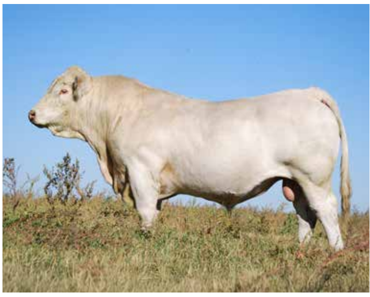
CJC MR PRESIDENT T122 SIRE OF LOT 19