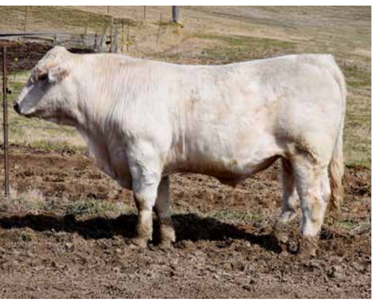
MILHORN'S MONEY MAKER 2336 SELLS AS LOT 4

Sells Fertility and Trich Tested. Selling Full Interest and Full Possession This high-end bull is a duplicate of his sire, WCR Gambler 1167, that was a top seller in a Wienk Sale. Gambler is a calving ease sire with strong milking daughters. Top 15% Milk and 20% MTL on 2336! Dam is a super producer with CI of 12/21; 12/22; and 12/23 and a very solid Grid Maker and Cigar mating.