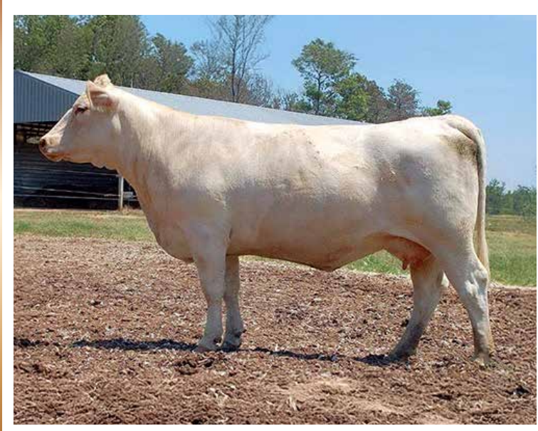
ORR'S MAUREEN 312 P ET GREAT-GRANDDAM OF LOT 29