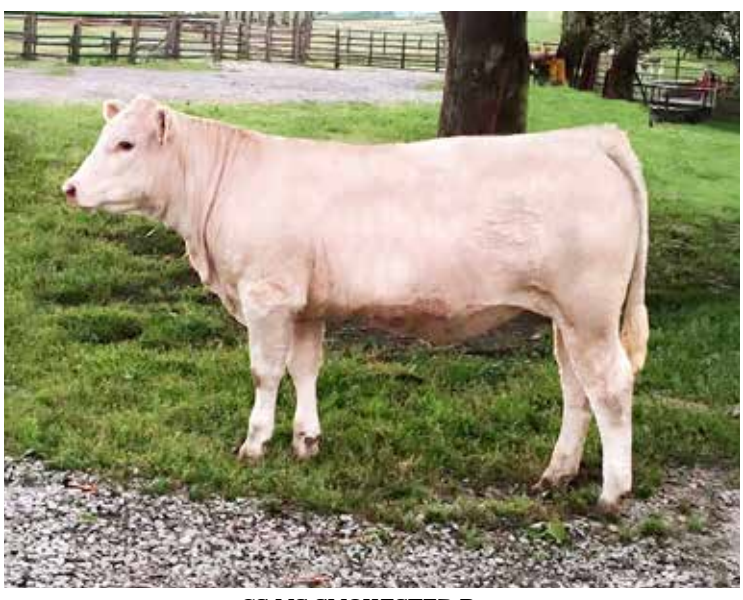
CS MS SMOKESTER D119 DAM OF LOT 58