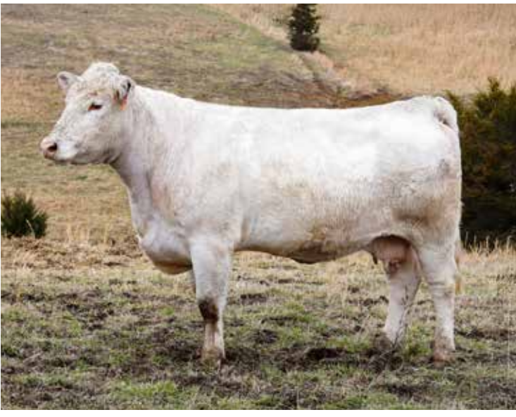
REAVES MS MASTER GERMAINE 2265 SELLS AS LOT 40

Sells Bred A-I on 9/19/24 with sexed heifer semen from LT Countdown 9712 Pld, safe in calf. Her dam has produced 19 calves and her granddam the great 1981 has produced 30 calves showing this is a very functional and productive cow family! The Countdowns are easy calving for this first calf heifer and have tremendous EPDs. Lots of potential with this rich history of brood cows!