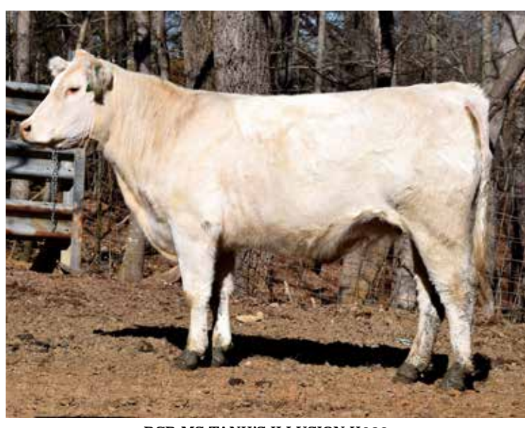
RCR MS TANK'S ILLUSION K902 SELLS AS LOT 14