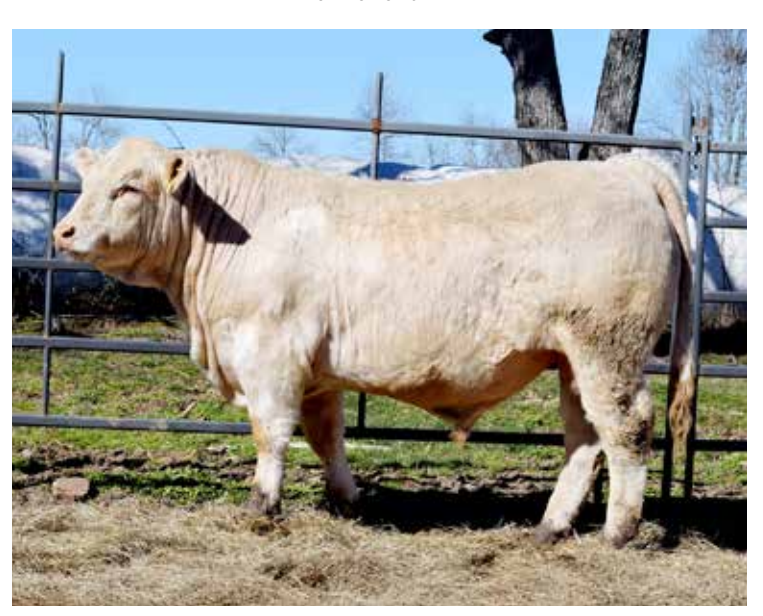
B&B LEDGER 2387 ET SELLS AS LOT 3

Sells Fertility and Trich Tested. Selling Full Interest and Full Possession Another solid, thick, deep-bodied, easy-fleshing bull that will produce calves that are scale mashers! His dam is a superb Smokester cow with a great record, 13 calves registered with AICA. A full sister is in The Stabel herd, KS. Buying proven genetics keeps your herd moving forward with less problems!