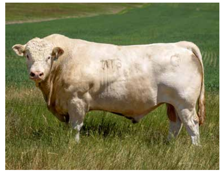
DC/CRJ TANK E108 P SIRE OF LOT 18