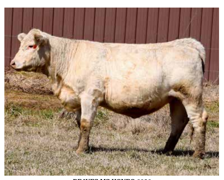
REAVES MS HONDO 2306 SELLS AS LOT 33

Safe in calf 7 months and due around sale time to Reaves Germaine Hova 2281, a HOP, (homozygous Polled), and PAF sire! Ms Hondo is a maternal sib to Lot 10 bull that is selling. Hondo is a featured sire in the Fink and Larson breeding programs. EPDs rank in the top 20% WW, 4% YW, 15% Milk, 9% MTL, 3% CW, 10% REA, 5% Marb, and 2% TSI for Ms Hondo. This moderate frame coming first calf heifer descends from royalty at Finks, line-bred Gold Standard, Free Lunch, & Flash.