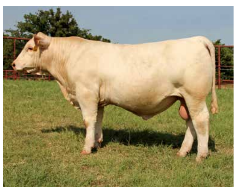
M6 LAW & ORDER 577 P SIRE OF LOT 31