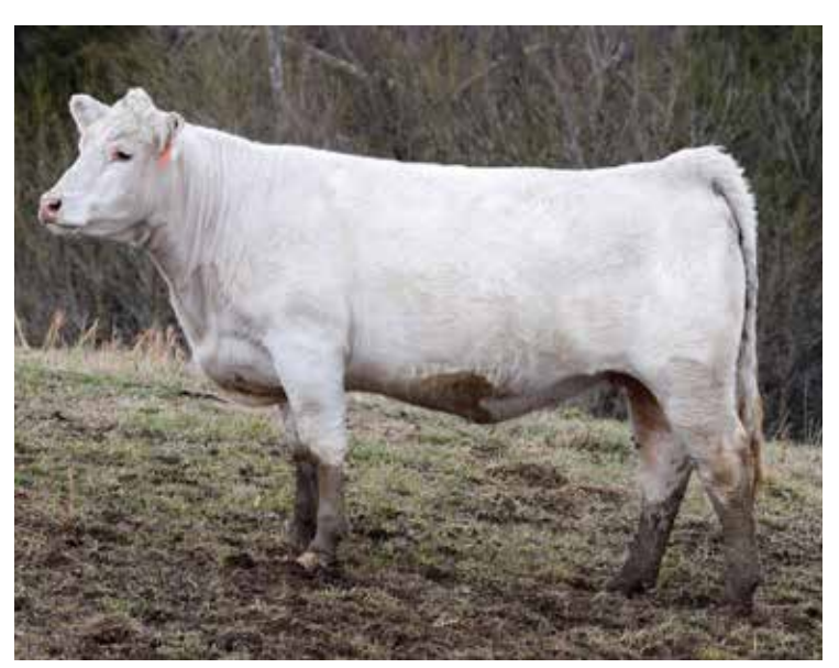
REAVES MS MASTER CHIEF 2324 SELLS AS LOT 41