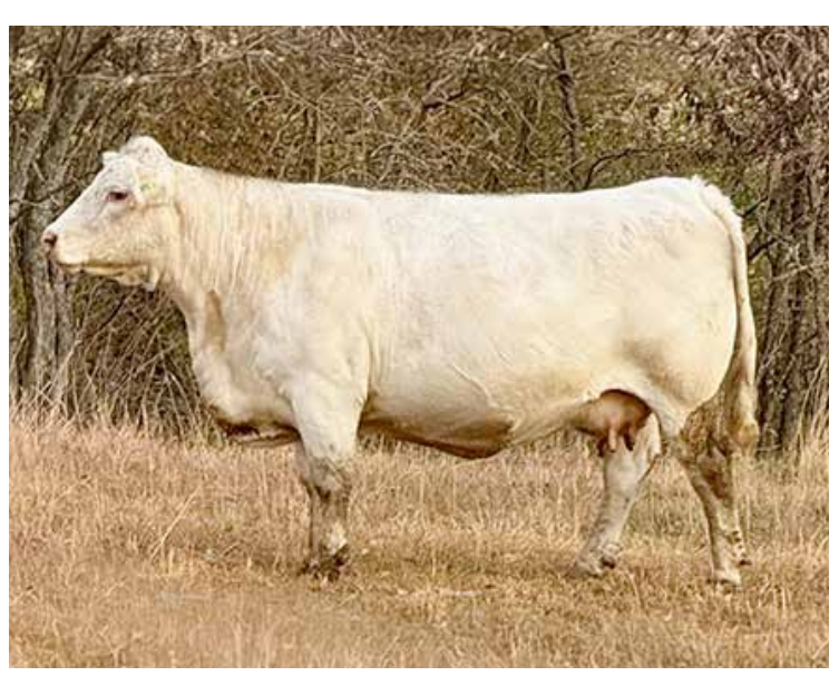
LCC MISS LADY 0308 653 BF DONOR DAM OF LOT 60B