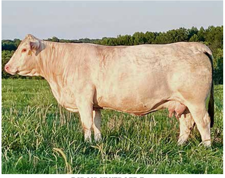
DCR MS SILVER LED F136 DONOR DAM OF LOT 60A

Selling 3-Convential embryos from mating of JMAR Hosea 2M70 x NH Lady 7450 0409 FL Est EPDs. Hosea is rated top 1% Marb and 7450 rated top 9% Marb along with 7% CE and 10% BW. A full sister to 7450 produced the high selling bull in Herndons 2023 Bull sale. Tremendous donor, good fertility, excellent disposition, superior udder quality, both are PAF.