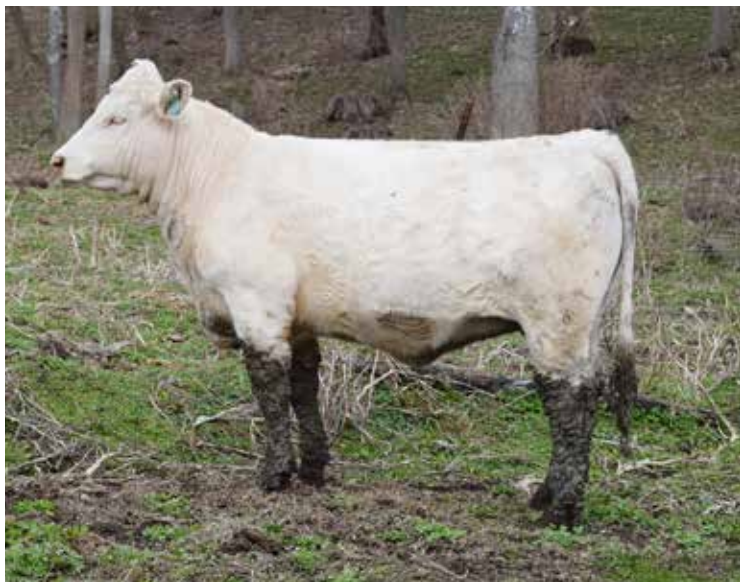
WELCOME GROVE 2401 SELLS AS LOT 45