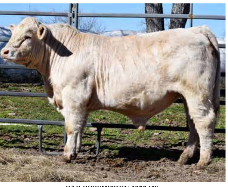
B&B REDEMPTION 2308 ET

Sells Fertility and Trich Tested. Selling Full Interest and Full Possession A cowmans dream, this power-packed, thick butted bull is loaded with muscle and depth. Proven pedigree of winning with his dam being a full sib to several National Champions. His granddam, 0641, has 332 progenies registered with AICA.