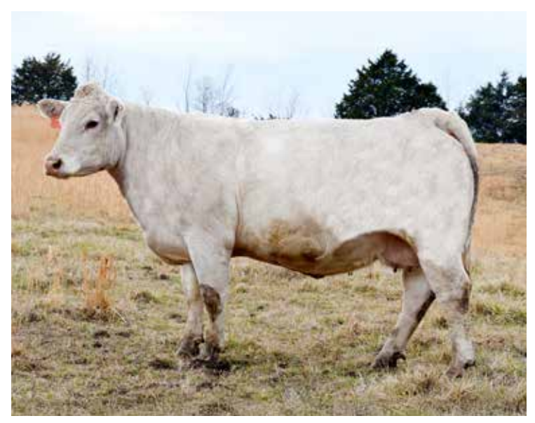
B.B. QUEEN LINDA 2100 SELLS AS LOT 36