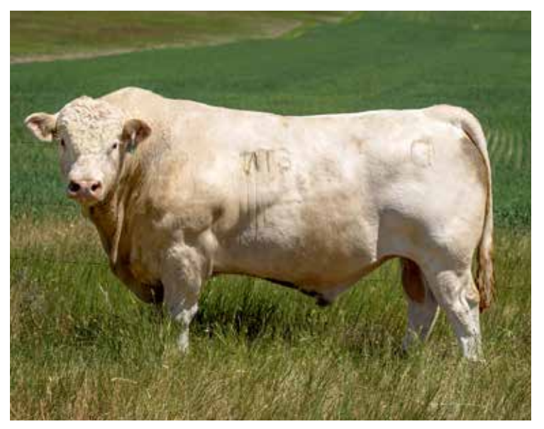
DC/CRJ TANK E108 P SIRE OF LOT 6