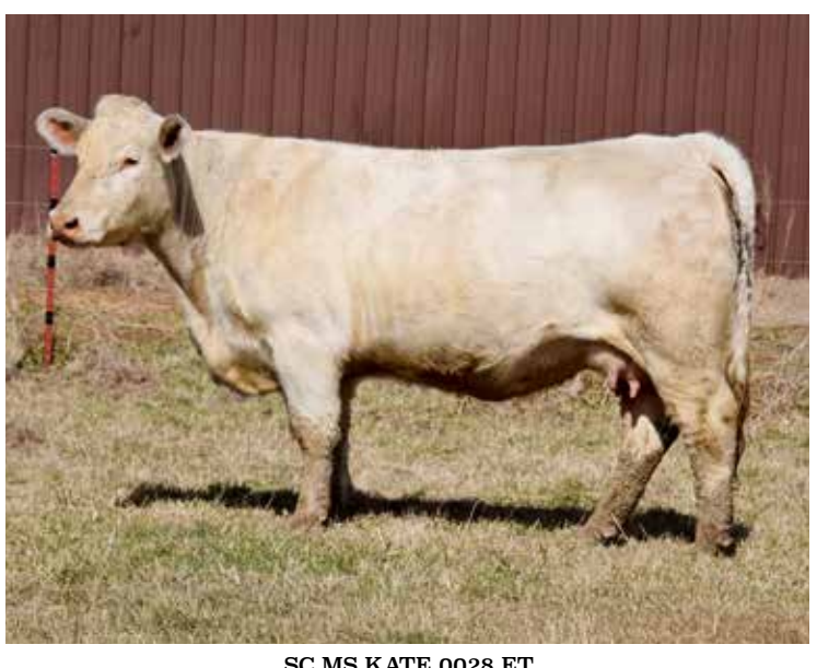
SC MS KATE 0028 ET SELLS AS LOT 26

PE bred to Reaves Mr GE Monticello 2345, EM1007981. A paternal sib to Major, the Canada and Denver Champion. EPDs rank in top 6% WW, 8% YW, 6% Milk, 2% MTL, 3% CW, 7% REA, 10% Marb, and 4% TSI at 290.98. Excellent conformation, deep, long-bodied, straight lines, square hip and highly feminine!