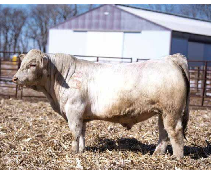
WCR GAMBLER 1167 P SIRE OF LOT 15

Breeding status to be announced at the sale on this younger heifer. Super design of strong maternal look to this prospect! Good depth, length, and natural thickness in this eyeappealing heifer. Not a big EPD package here, but you can tell the quality is abundant along with good performance that makes for a profitable operation. Breeding to Master Chief will send the EPDs on her calf to a highly acceptable number!