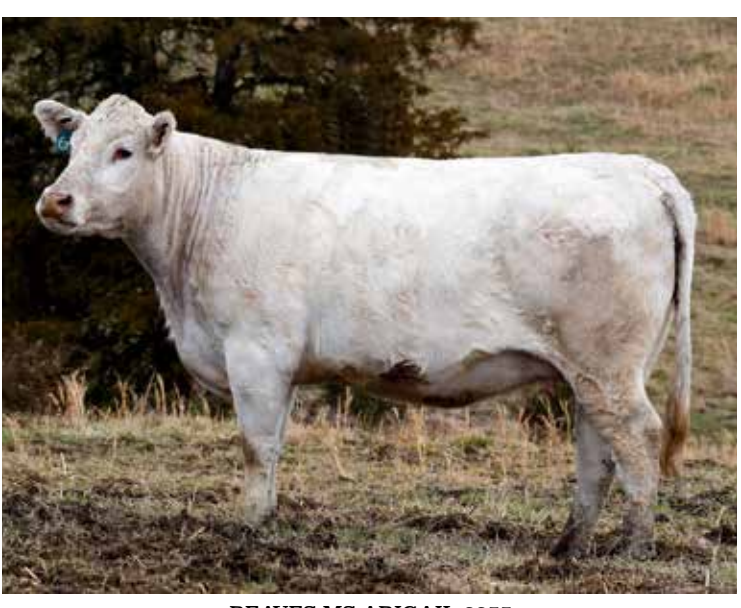
REAVES MS ABIGAIL 2255 SELLS AS LOT 27