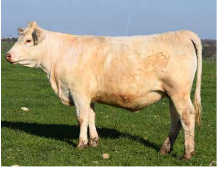
MS PC CRAZY CORA 1821 DAM OF LOT 42

Safe in calf 7 months to Reaves Germaine Hova 2281, a JMAR Hosea son out of M6 Cool Germaine 1145. Cora descends from the great Lehmanns Donor cow, 745, they purchased in the Sale of Excellence for $17,500 and now have 40 progenies from her registered with AICA. With Tank she also excels with EPDs ranking in the top 8% CE, 35% WW, 10% YW, 2% Milk, 3% MTL, 7% CW, 35% Marb, and 3% TSI, (293.84).