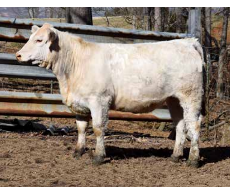
MILHORN'S MISS RINGER 2301 SELLS AS LOT 16