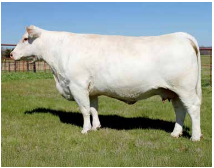
M6 MS NEW NANCY 274 P ET GRANDDAM OF LOT 34