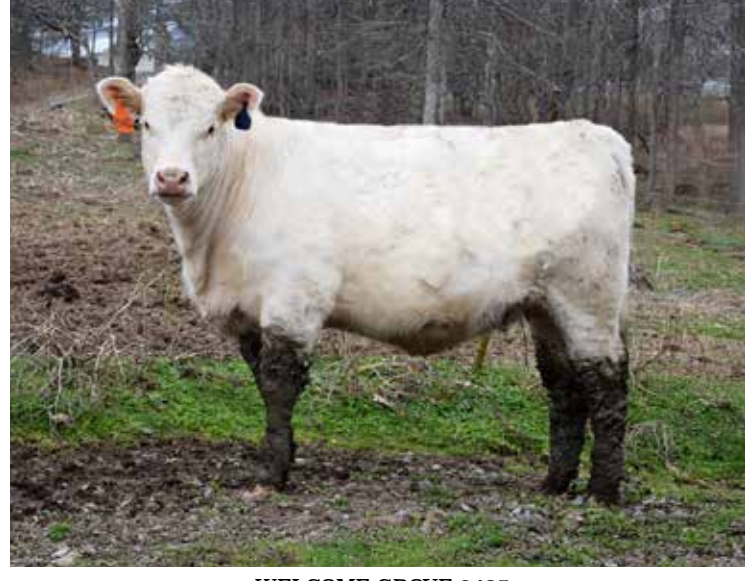
WELCOME GROVE 2405 SELLS AS LOT 46