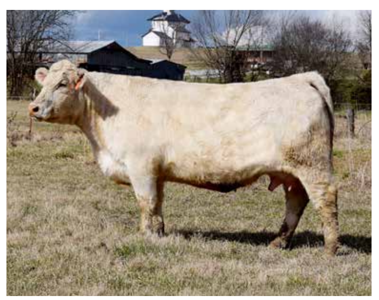
REAVES MS ICON ANNIE 2211 SELLS AS DONOR DAM OF LOT 25