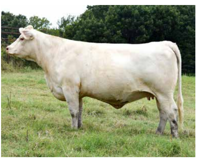
DCW LADY E9192 DAM OF THE SIRE OF LOT 53