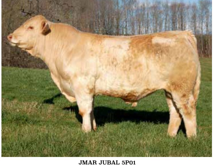
JMAR JUBAL 5PO SIRE OF LOT 32

Due before sale to Reaves Germaine Hova 2281, EM985582. A JMAR Hosea 2M70 son out of M6 Cool Germaine 1145. Maternal sib to Lot 31, another great brood cow to develop and bred to the exciting new Hosea son. Started with a 65 lbs BW and grew rapidly to wean at 698 lbs giving credit to her sire and dam! Full Throttle was also a maternal sib to Reaves former AICA Trait Leader, M6 Led Weight 609.