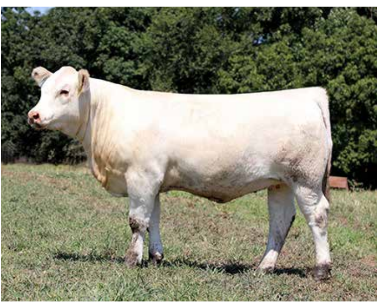
LCC TEXAS PROUD MARY 1741 DAM OF LOT 35