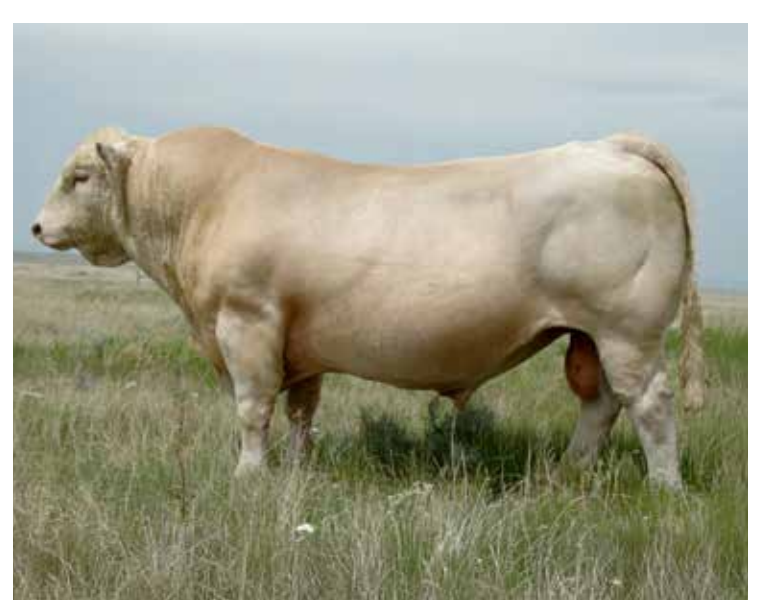
LT BLUE VALUE 7903 ET DONOR SIRE OF LOT 44

Blue Value and 7758 are both PAF. Another set of great numbers to work with and some of the most popular genetics in the breed today! Daughters from this mating would be awesome and the bulls a cowmans dream!