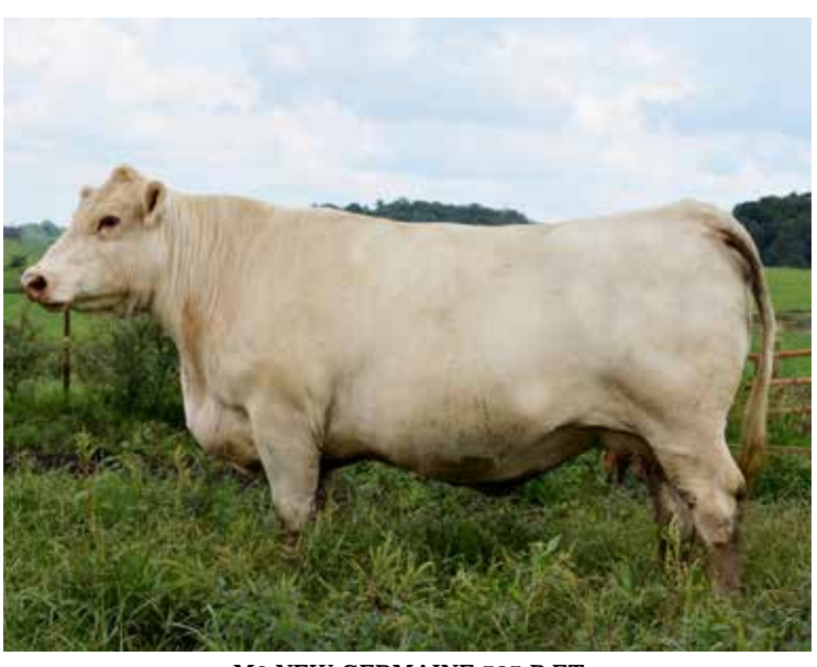
M6 NEW GERMAINE 585 P ET

Est. EPDs. You will be very impressed with all the Jubals in the sale, they are making tremendous bulls and females! JubalÕs are some of the best dispositions in the breed, very correct in structure and design, good depth and thickness.