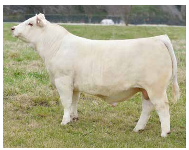
CCC WC RESOURCE 417 P SIRE OF LOT 28

28A: Pld bull calf, born 2/27/25, sired by Fink 2230 of 77 467. The Maureen cow family has been an integral part of the Reaves program. The lot 29 is a maternal sib to Dolly. The dam, 310 has produced 9 calves, her dam, 280 has produced 5 calves and working for Cawley Cattle Co., and her dam 312, was in the Arlitts ET program and produced 14 calves. Dolly ranks in top 20% Milk and MTL, top 15% REA and TSI for Breed EPD rankings.