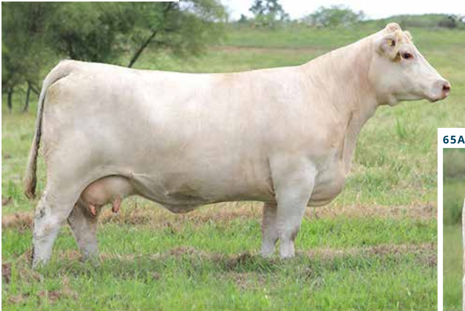
LCC TEXAS ROSE 3749 ET

65A: Pld heifer calf # 1394, born 2/1/24, bw 74, sired by ACE-ORR Lock N Load 243 P. Bred A-I on 5/12/24 to LT Countdown 9712 Pld, DUE 2/16/24. Both cow and calf are PAF and HOP. Lehmann save up to bring you, their BEST! What a beef cow! Plenty of milk in a sound quality udder. She ranks in top 15% for Milk EPD and 25% MTL. Her CI is 1/21; 1/22; 12/22; and 2/24 for super display of fertility! WHOA! Her calf is awesome! Already shows brood cow deluxe! Ranks in top 20% WW, 6% YW, 15% Milk and MTL, 30% Marb and 7% TSI, (283.05).