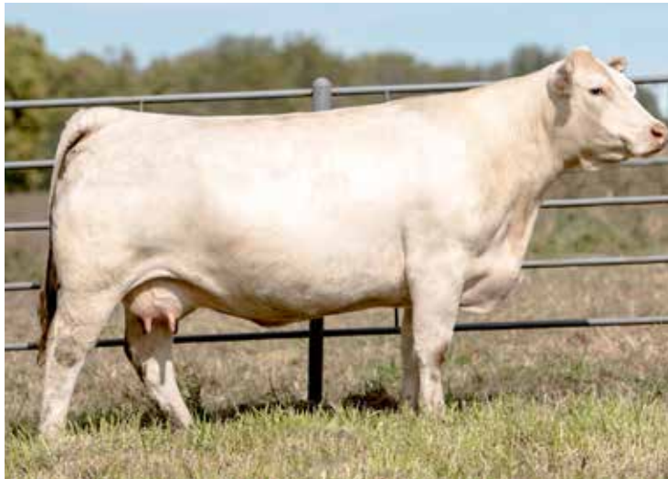
WC CLARICE 2214 P ET DAM OF LOT 46

PAF, Bred A-I on 2/23/24 to Renn Cowboy Romeo 1505, M959839, (PAF, HOP). Reserving 1 successful flush. Has averaged 12 embryos in 3 flushes. An own daughter of the great donor New Jewel 0155 Pld. Jewel 0155 has 65 progenies with AICA and is owned by Wild Indian Acres and Southern Cattle Co. 2255 is a power in EPD rankings with a top 2% WW, 1% YW, 15% Milk, 2% MTL, 1% CW, 7% REA, and 1% TSI. Her actual weaning wt of 1025 lbs with 107% ratio!!! Pedigree, Conformation, Performance, and Correctness, make this a front pasture Quality cow!