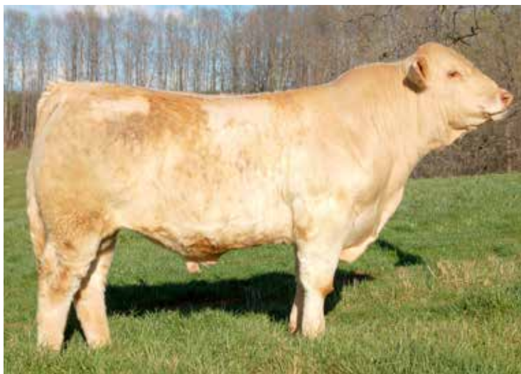
JMAR JUBAL 5P01 AI SIRE ON LOT 31

Bred A-I on 3/12/24 to JMAR Jubal 5P01, M953191, PAF, HOP. This son of Pleasant Dawn Chisum is a very easy calving sire and his calves have the best disposition of any bull we have worked with. His dam was a featured donor at JMAR's. WOW! What a magnificent heifer! PAF, a beautiful designed heifer, very correct, plenty of volume, thickness, depth and correct lines for super eye-appealing conformation! Gridiron 437W has sired some amazing females and this certainly is at the top of the list! Foreman is a calving ease and marbling specialist! A perfect match!