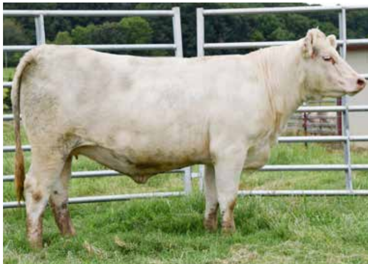
REAVES MS REDEMPTION 2273 SELLS AS LOT 68