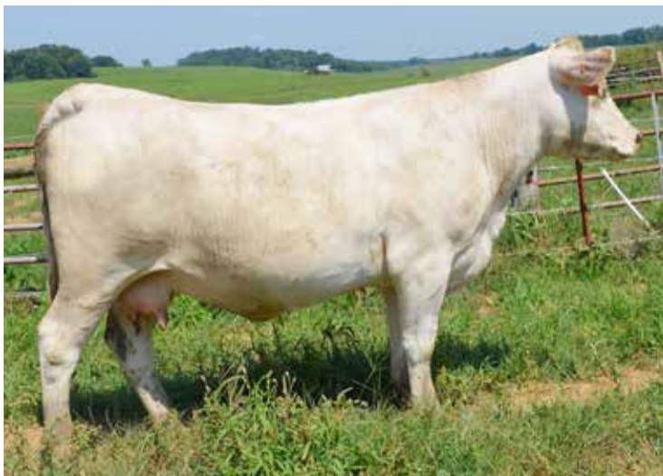
REAVSE MS GERMAINE SOURCE 2065 DONOR DAM OF LOT 23