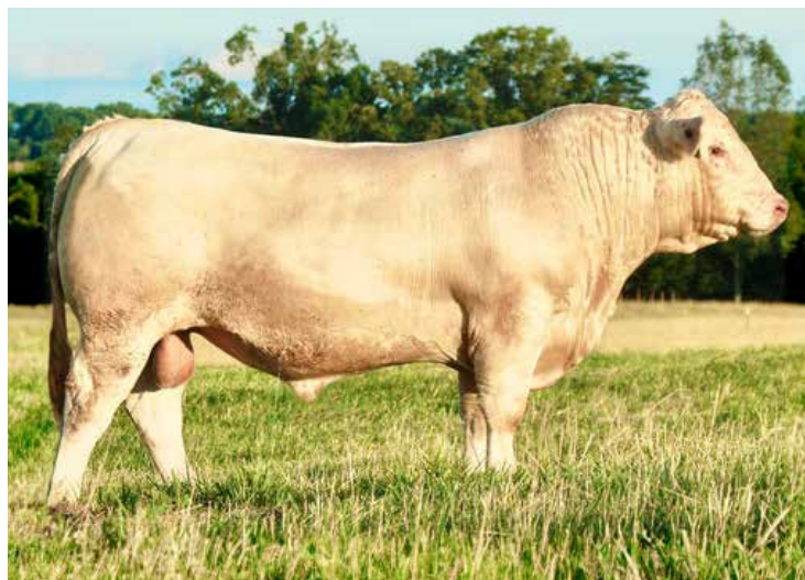
JMAR JEFFERSON 8M11 FULL SIB TO LOT 58 EMBRYOS

Selling 3 IVF embryos from the mating of FTJ Monticello 1806 x DCR Ms Silver Led F136. This would also be full sibs to JMAR Jefferson 8M11 and JMAR Joshua 23M11, a herd sire used at Herndon Farms, GA. Raise your own great herd sire or dam with this phenomenal mating! One of the more elite set of embryos selling this year! Monticello is PAF and HOP, Silver Led is PAF and has produced 8 calves, mostly ET, but very efficient and good fertility. Also selling a flush in Silver Led in Lot 59.