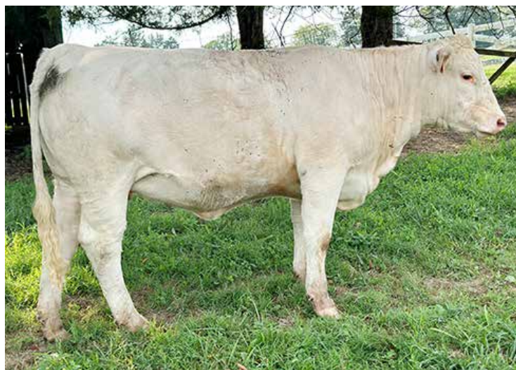
LMH LADY SPARK SELLS AS LOT 27

Sells Open. A maternal sib is in the Holt Charolais herd, TN. Another sib remains in the herd at LMH. A very feminine heifer with extra length, clean extended necked, square hiped, with plenty of volume and thickness. She descends from some of the proven and popular sires in the breed. This young female will work well with some of the popular top EPD bulls in the breed.