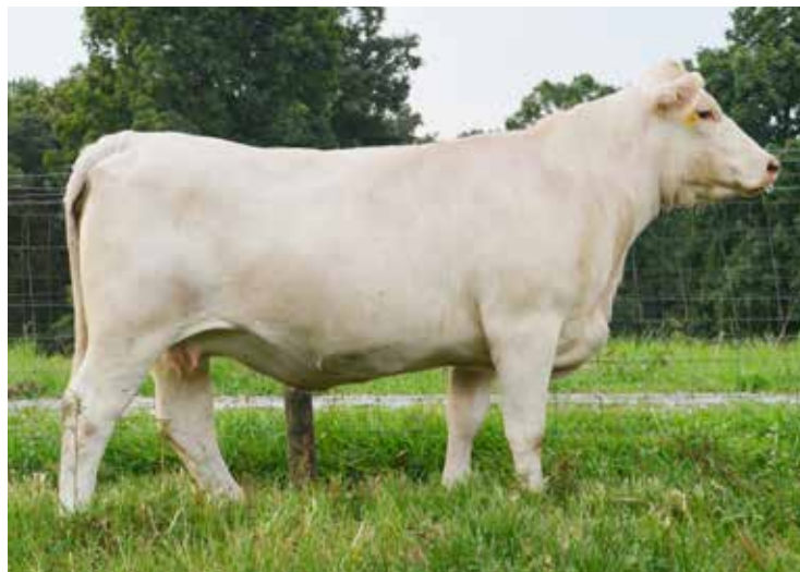
OHF VANESSA K831 ET DAM OF LOT 12