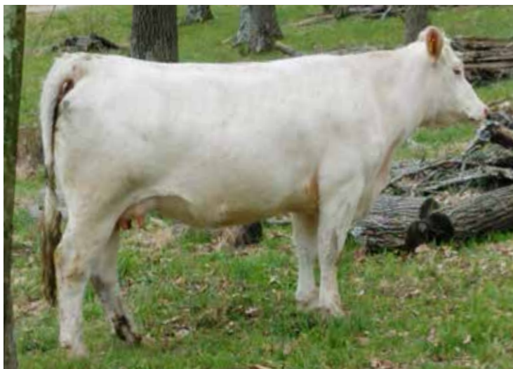
TNT SUPREME OBSIDIAN G1912 P SELLS AS LOT 40