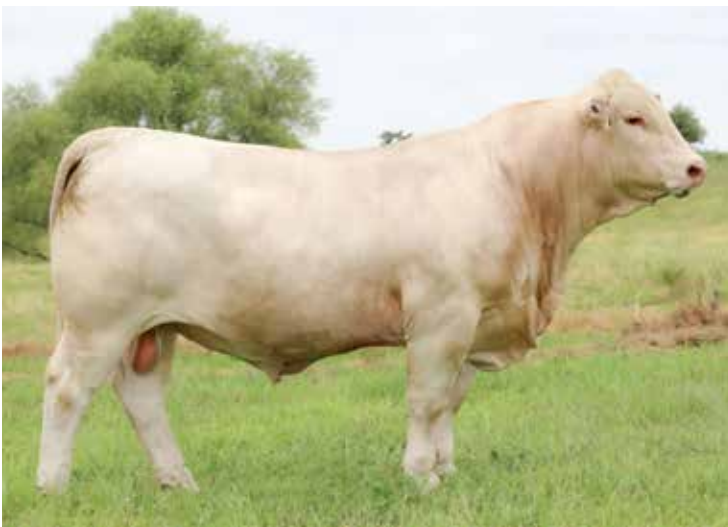
RCR LCC COUNTING ON ME 3405 SELLS AS LOT 3