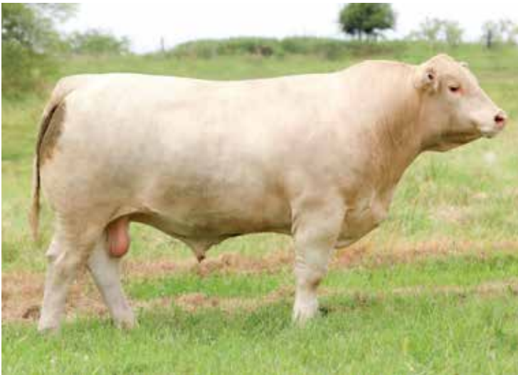
LCC TEXAS RANCHER 9752 SELLS AS LOT 2

Selling Full Interest and Full Possession. Fertility and Trich Tested. Big, powerful made, thick, muscular herd sire with great lineage! Tank is proven to be one of the great "Breeding Sires" in the breed. His progeny has been very popular and both sons and daughters have sold extremely well! His dam reflects some of the best with Cigar and Reaves great donor cow 5003, a daughter of the elite HBR Lady Gi 207. Ranks in the top 15% for YW, CW, 20% Milk and MTL, 30% REA, and 20% TSI.