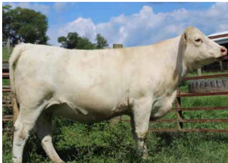
OHF SHE A902 ET SELLS AS LOT 43

PAF, Sells bred A-I on 5/31/24 to LT Affinity 6221 Pld; PE from 6/10/24 to 7/30/24 to BWC Laredo L31, M993539. If you want EPDs, then this cow is yours! Ranks in top 2% WW, 1% YW, 15% Milk, 2% MTL, 1% CW, 7% REA, and 1% TSI, (297.29) Cow with great eye-appeal, correct with good capacity, with excellent udder quality. Strong topped, square hiped, long bodied, long, clean necked, feminine female! It would be hard to write a better pedigree with all the stars of the breed in hers. Retaining her daughter in Kee Hill herd!