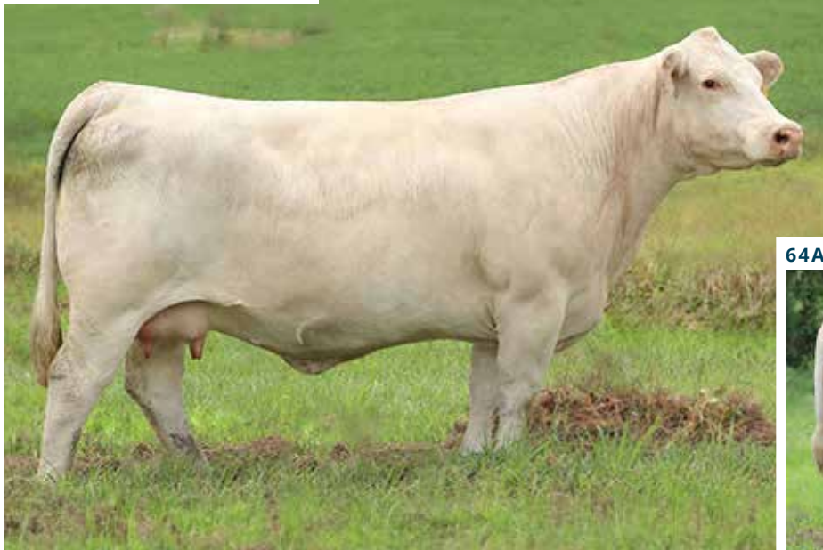
LCC MONTANA RUTH 1649

64A: Pld heifer calf # 1194, born 12/3/23, bw 75, sired by JMAR Jefferson 8M11. Sells A-I bred on 2/2/2024 to WC Inferno 6561 P, M897949. DUE 11/8/24. FANTASTIC PAIR! Both cow and daughter are PAF and HOP. Stunning cow with heaps of volume and capacity. Great udder quality and attachment on a well-designed structure. She also ranks in top 15% for Marbling and 4% for TSI, (275.91). Show quality calf ranks in top 1% for WW, YW, 25% Marb, and 1% TSI, (312.54). You can't be serious about purebred cattle if this heifer doesn't peak your interest!