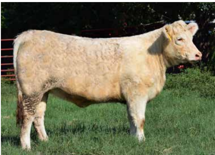
WC ADRIAN FORCE 371 SELLS AS LOT 19