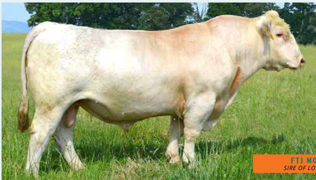
FTJ MONTICELLO 1806 SIRE OF LOT 54, 55 & 58 EMBRYOS