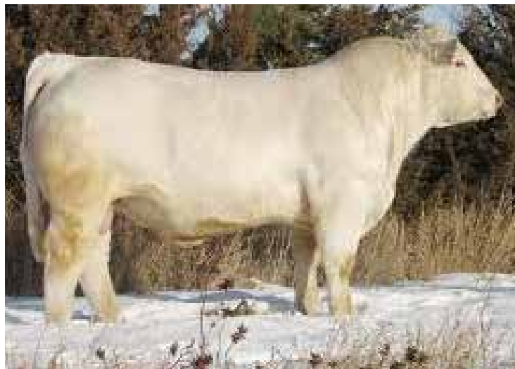
KEYS TEN-ACIOUS 166S GRANDSIRE OF LOT 21

Sells bred A-1 on 1/15/24 to LT Atlas 0251 Pld, M943509. Atlas is certainly distinguishing his breeding prowess already by siring the record setting LT Global 3322 for $300,000.00 in Lindskovs' 2024 Bull sale. This very feminine young female incorporates some of the top names in the breed! On the sire side is Key's Tencacious, the tenderness bull and M6 Big Top 268 the REA specialist and on the bottom side the great maternal making sire, Grid Maker and an own daughter of "Miss American Beef", B309, DR Forever Lucy 401. Quite a package here!