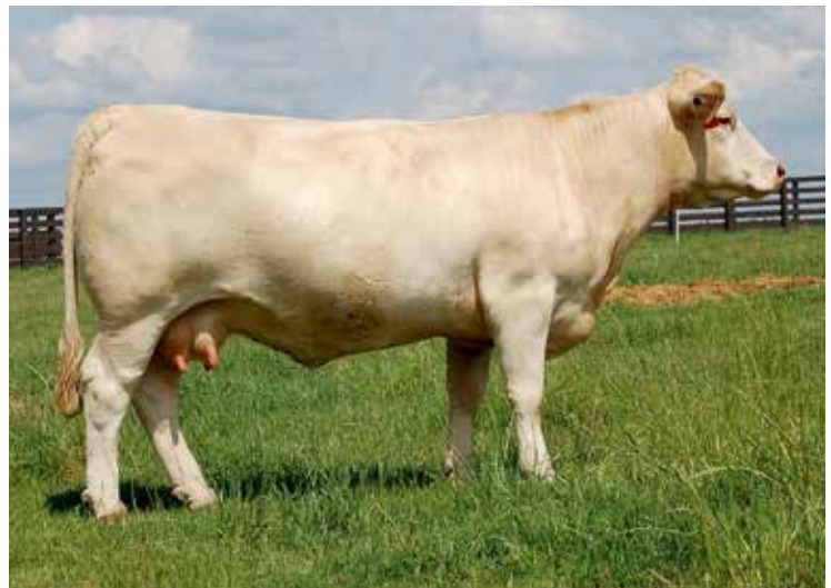
OHF VANESSA 4121 ET DAM OF LOT 6

Selling Full Interest and Full Possession. Fertility and Trich Tested. A very practical, long-bodied, thick bull that will greatly increase performance and reliability in his offspring. A skeletal correct bull with great disposition and solid, sound feet and legs. His sire did a tremendous job for Welcome Grove with his super influence of Rio Bravo and Hales Ms Grid 717, a donor for Timmber Farms., MS, with 18 progenies registered with AICA. She also produced calves for Wild Indian Acres, MO.