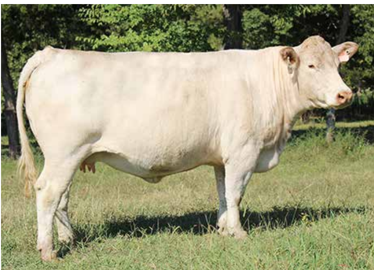
AFG 9248 GM 248 ET SELLS AS LOT 24

Selling 3 conventional embryos from mating of LT Countdown 9712 Pld and Reavse Ms Germaine Source 2065. Tremendous EPDs make these embryos very valuable to any serious breeder! Stellar pedigree with the proven influence of New Standard and the legendary Germaine 1145 in the background! Countdown is PAF and Homozygous Polled and 2065 is PAF. Kyle Reaves still owns a daughter sired by Master Chief 037. Real profit making opportunity here!