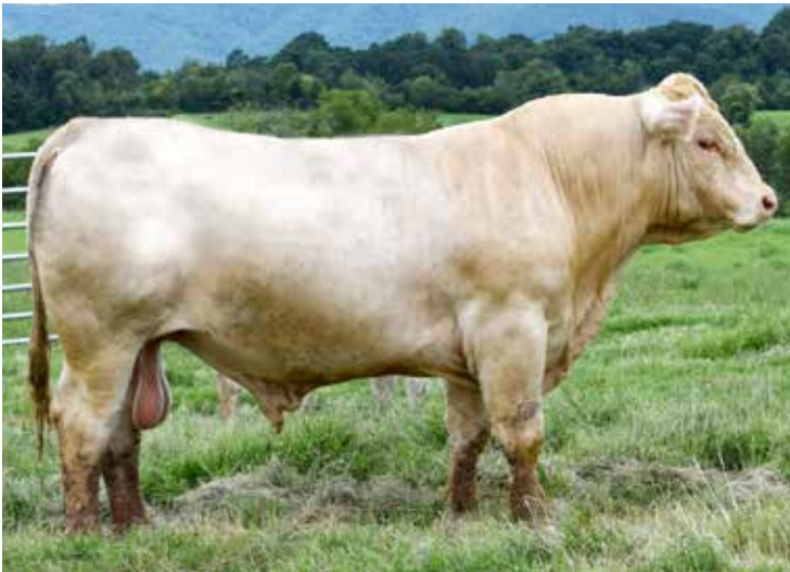
REAVES TANK 2272 SELLS AS LOT 1