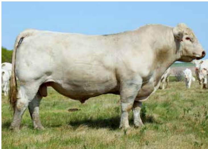
WCF MR SILVER GUN 467 SIRE OF LOT 47