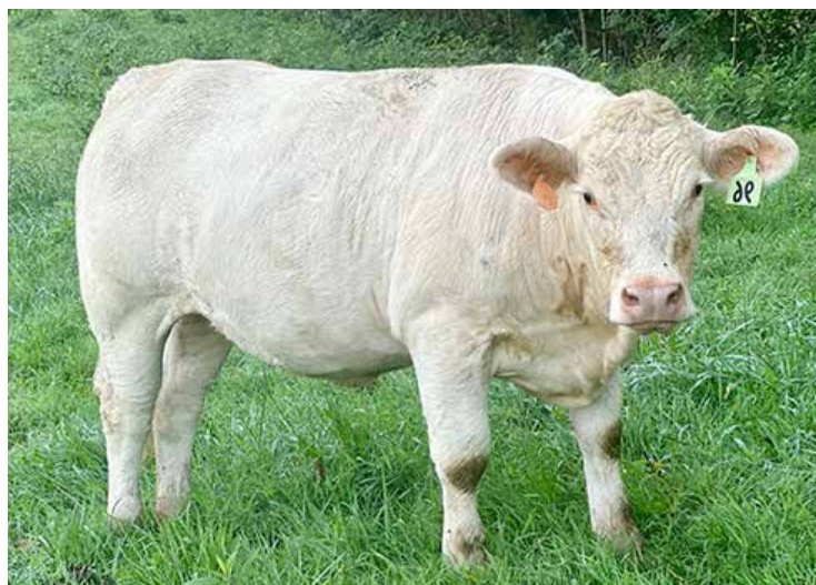
LMH LADY FLARE SELLS AS LOT 28

Sells Open. Paternal sib to Lots 27 and 29. Another big volumed heifer with lots of capacity and thickness. The LMH Gridline bull produced some great females with super correct udders. On the bottom side she also traces to the Bamark cow that was the dam of LHD Ali Ruler W31, a several time AICA Milk Trait leader. This heifer will make an ultimate top end brood cow!