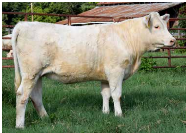
WC ZEUDY 381 SELLS AS LOT 20

Sells Open. A tremendous profile on this sharply feminine heifer loaded with volume, depth, and big square hip! A tremendous pedigree as well with this top performer! I think after viewing these 3 Genesis daughters you can easily see the super quality and performance ability. Study's dam is another great Zeus daughter. Zeus is a maternal sib to BHD Reality T3136 that has played a major role in many progenies in the U.S. Think about how buying all three of these very stout heifers would enable you to have a top-end breeding program that would empower any sire to excel!