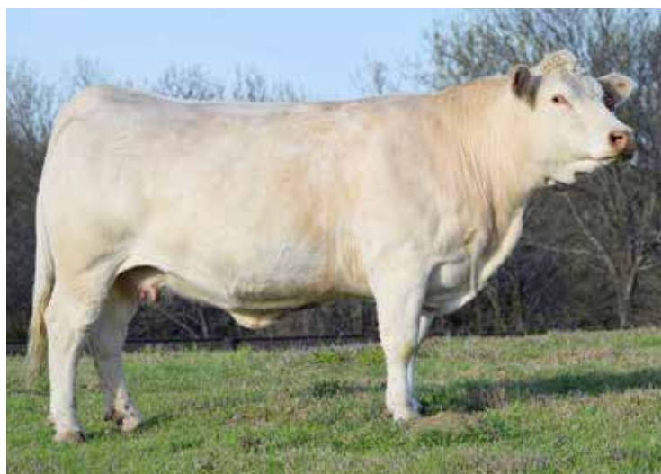
JDJ MS TRUEMARK Y322 DAM OF LOT 51

THANK YOU GEORGIA, FLORIDA & SOUTH CAROLINA CHAROLAIS ASSOCIATIONS FOR SPONSORING THE 2024 SALE!