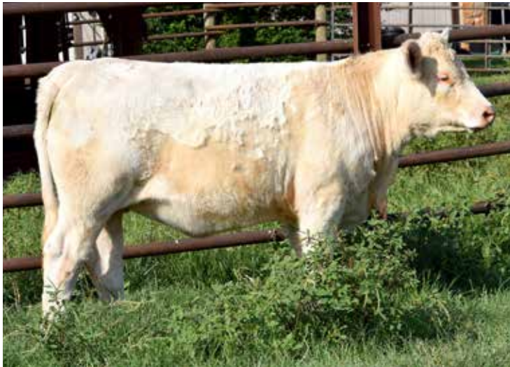
WC ELSA DUTTON 302 SELLS AS LOT 18