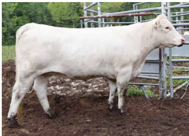
FRED MISS TOMY 25 SELLS AS LOT 33

PE to Reaves Mr Value Added 2255, EM977005. 2255 is a PAF son of LT Blue Value 7903 Pld and out of M6 Ms New Germaine 585 Pld. Miss Tomy shows extreme length of body with ultra femininity and correctness! This should be a great power mating with Tomy ranking in top 20% CW, 5% Marbling EPDs and 2255 ranking in top 8% CW, 9% REA, 20% Marb, and 15% TSI along with his 6% WW, 15% YW, and 8% MTL! This should be a must have lot to move a program quickly forward!