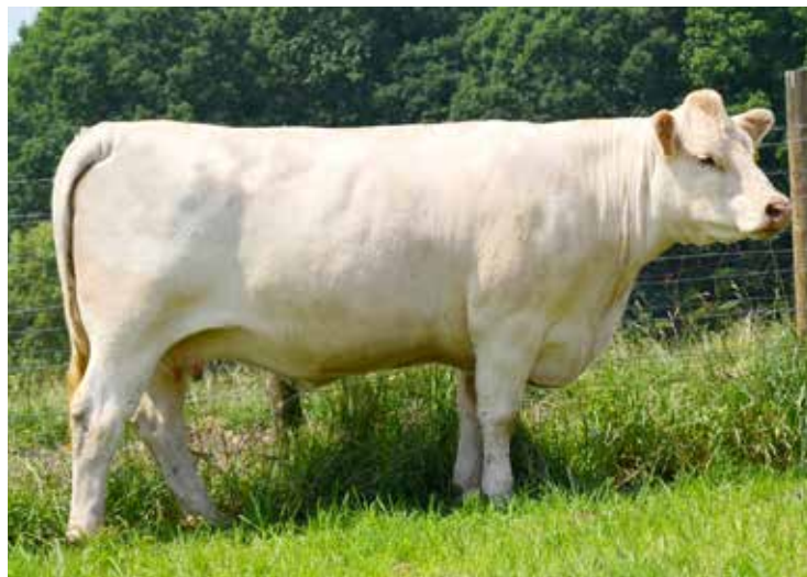
OHF WINDY E904 ET DAM OF LOT 15

15A: Pld Heifer calf # B476, born 1/21/24, bw 73, sired by Heart J Royal Range 1743, M960235. Sells PE from 2/7/24 to 5/7/24 to DC/CJC Sage K1175, M982947. Royal Range is a blend of Resource 417 and Cooley Royce. Sage is a grandson of Shark, one of the power herd sires at DeBruycker's and his maternal grandam is F1380, the 2024 "Pick of DeBruycker Herd". Her dam, E904, is in the Herndon Farms ET program and has produced 18 offspring registered with AICA.