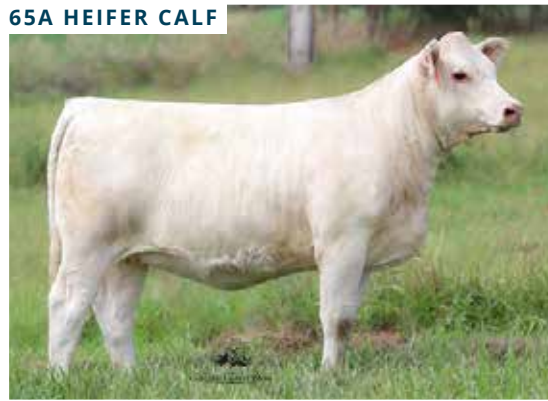
65A HEIFER CALF

65A: Pld heifer calf # 1394, born 2/1/24, bw 74, sired by ACE-ORR Lock N Load 243 P. Bred A-I on 5/12/24 to LT Countdown 9712 Pld, DUE 2/16/24. Both cow and calf are PAF and HOP. Lehmann save up to bring you, their BEST! What a beef cow! Plenty of milk in a sound quality udder. She ranks in top 15% for Milk EPD and 25% MTL. Her CI is 1/21; 1/22; 12/22; and 2/24 for super display of fertility! WHOA! Her calf is awesome! Already shows brood cow deluxe! Ranks in top 20% WW, 6% YW, 15% Milk and MTL, 30% Marb and 7% TSI, (283.05).