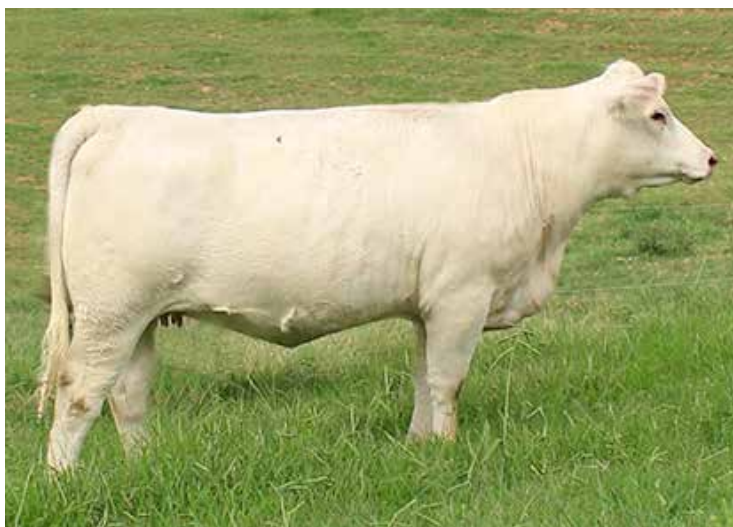
RHC MS GRID 2205 SELLS AS LOT 30