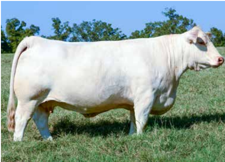
M6 MS NEW JEWEL 0155 PLD DAM OF LOT 45