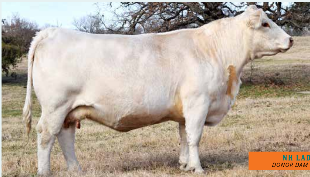
NH LADY 7450 0405 FL DONOR DAM OF LOT 60 & 61 EMBRYOS