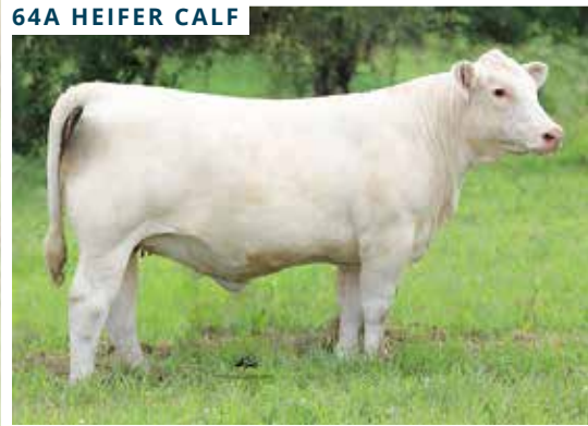
64A HEIFER CALF

64A: Pld heifer calf # 1194, born 12/3/23, bw 75, sired by JMAR Jefferson 8M11. Sells A-I bred on 2/2/2024 to WC Inferno 6561 P, M897949. DUE 11/8/24. FANTASTIC PAIR! Both cow and daughter are PAF and HOP. Stunning cow with heaps of volume and capacity. Great udder quality and attachment on a well-designed structure. She also ranks in top 15% for Marbling and 4% for TSI, (275.91). Show quality calf ranks in top 1% for WW, YW, 25% Marb, and 1% TSI, (312.54). You can't be serious about purebred cattle if this heifer doesn't peak your interest!