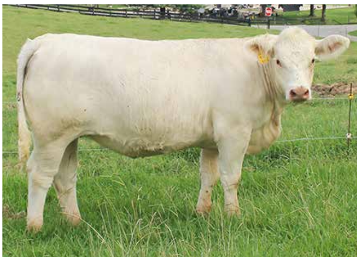
RHC MS GRID 2207 SELLS AS LOT 32

Bred A-I on 4/23/24 to JMAR Jubal 5P01. Both 2206 and Jubal are PAF. You can see the power in these Gridiron 437W genetics with the conformation and correctness of these heifers. This heifer is line-bred to Gridmaker 104 PET and traces to the great donor mating of LHD Cigar on DVCR Lady Duke 706 PET, the Rena cow family. Outcrossing this heifer now will see a unique development. She has the proven genetic background to move forward quickly!