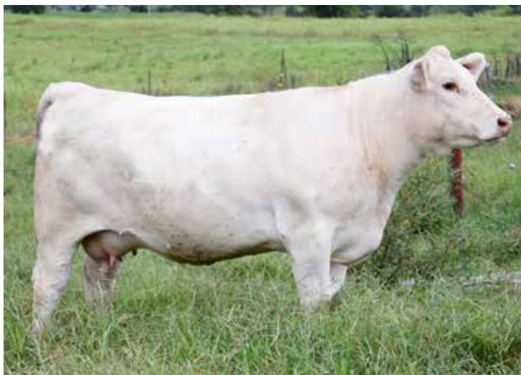
REAVES MS ABIGAIL 2255 SELLS AS LOT 67

8 Months safe in calf sale day to WCR Gambler 1167. This super heifer ranks in the top 40% WW, 7% YW, 20% for both Milk and MTL, 5% CW, 40% REA, and 5% TSI, (285.04). Gambler is PAF and HOP. A very solid bred young heifer from the proven Maureen Cow family that goes back several generations at Reaves. Tank continues to be very popular due to the quality of his calves, their growth and performance and solid numbers. These good young cows have great potential for the next several years of production.