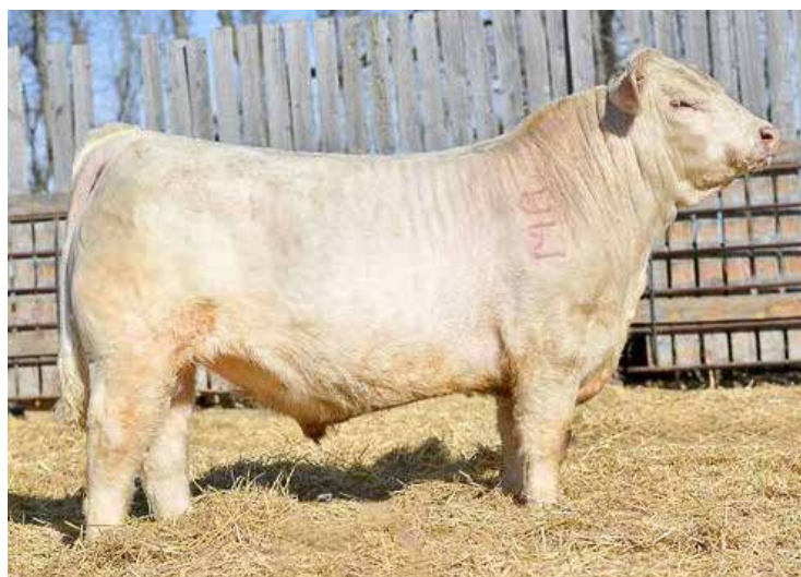
WCR REMIX 606 ETP GRANDSIRE OF LOT 34