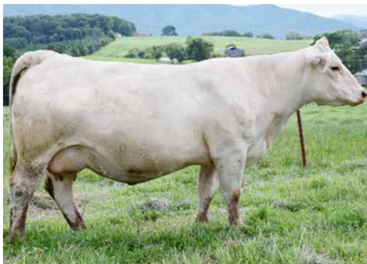
B.B. QUEEN LINDA 2100 SELLS AS LOT 69

DUE before the sale to WCR Gambler 1167 P. The Queen is another great brood cow with fantastic udder quality, both structure, size, and attachment. All the Milestone's seem to have the same great udder qualities. This top young cow traces back to the same Maureen 310 cow in lot 66. She ranks in the top 30% WW, 35% YW, 30% Milk and CW, 15% both REA and Marbling, and 30% TSI. Gambler is PAF and HOP and ranks in the top 6% for Milk, 8% MTL, 15% REA, 30% Marb, and 20% TSI, (273.49).