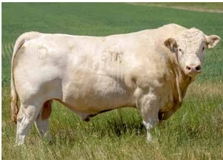
DC/CRJ TANK E108 P SIRE OF LOT 66