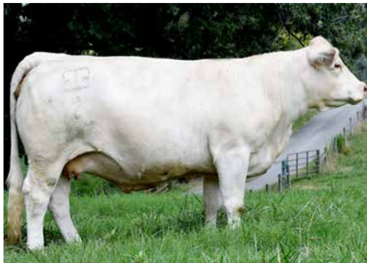
GF MS TAC 891 SELLS AS LOT 22

Sells 3 months safe in calf on 7/29/24 to Reaves Germaine Jack 2304, M985428. PE from 5/1/24 to 8/15/24. A beautiful model for Charolais females, stout-made, thick, deep bodied, and feminine with a perfect udder quality. This easy-fleshing cow offers great ability and has that look of daughters sired by WCR Duke 815 of Buck Compton. He's on the dam side of pedigree and she is linebred to another top female producer, HBR Magnum 93 P. A great disposition enhances her value along with a top 30% CE and 25% Marb EPDs. She had a 703 WWT with 101% ratio.