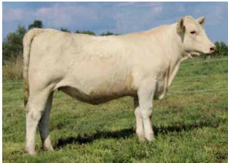
KHf MISS LADY 103 SELLS AS LOT 44

Sells Open. Super attractive heifer displaying great potential with size, bone, volume, and femininity! Several great family members from the Fink Miss Lady 068 4298 GS, including back to the LCC Miss Lady 8857 6868 FL that sold for $33,000 in Denver sale to Riverdale Land & Cattle. Lady 103 ranks also as high-ranking EPD cow with top 5% WW and YW, 25% Milk, 3% Marb, and 7% TSI, (283.25). The Keystone cattle definitely live up to the praise and talk of his sire prowess! They've retained several full ET sisters but wanted you to see the "Elite" in their herd!!