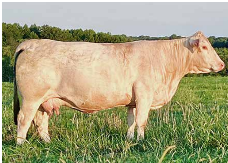
DCR MS SILVER LED F136 SELLING GUARANTEED FLUSH

Selling a Guaranteed Flush in DCR Ms Silver Led F136. Ready to flush, selling a guaranteed flush consisting of 7 transferable embryos or a proportionate refund. Buyer gets all embryos produced. Buyer pays all flushing and freezing costs. A Tremendous opportunity to invest in one of the highlight females of the breed. What bull will you choose to use might be your only real decision to contemplate! This type of consignment is very rare and a super value to any leading herd! You can lead or stay behind!