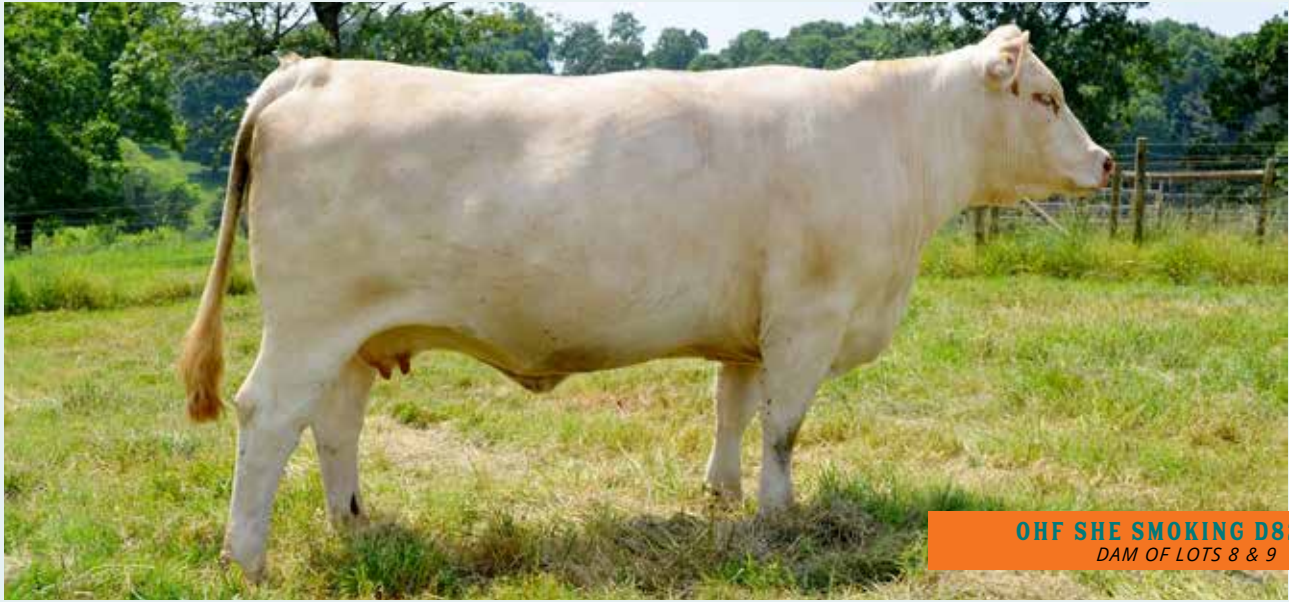
OHF SHE SMOKING D823 ET DAM OF LOTS 8 & 9