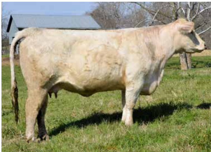
CCF MISS ALLISON 1928 DAM OF LOT 39

Sells PE to Reaves Mr Value Added 2255. Her dam, Nancy 38U has had 9 progenies and they reside in TN, VA, MO, TX, and Ok., showing the true value of these genetics. This top young female also shows the attractiveness you associate with the combination of her top side of Outsider and Firewater, two of the most dominating sires in Charolais show history! The blend of Value Added with her will certainly be exciting as he possesses the same great phenotype and correctness!