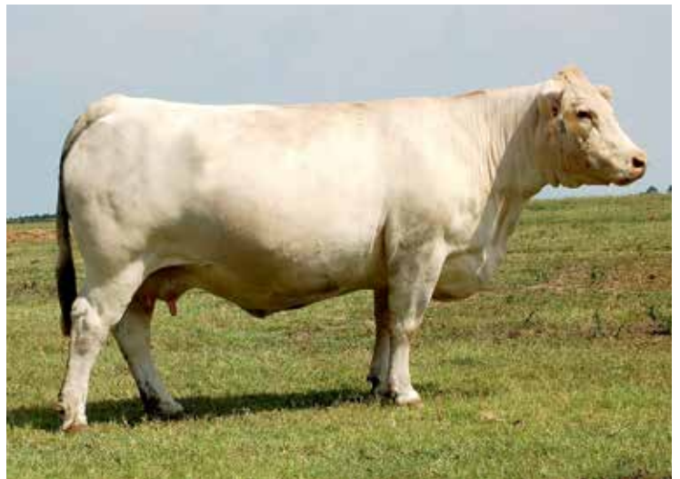
THREE TREES VANNA 2856ET DAM OF LOT 7